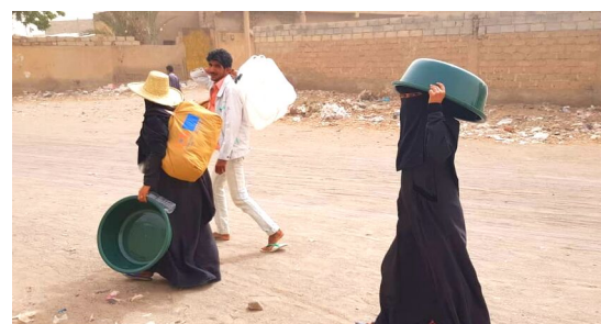
Distribution of RRM kits among displaced families in Hajjah Governorate.