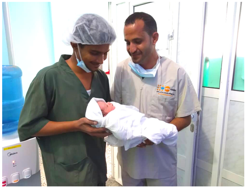
First C-section delivery at Al Dahi Hospital in Al Hudaydah supported by UNFPA