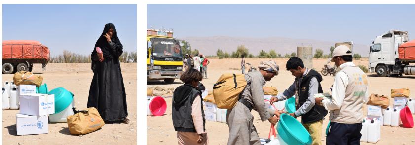
Distribution of RRM kits among displaced families in Al Jawf Governorate