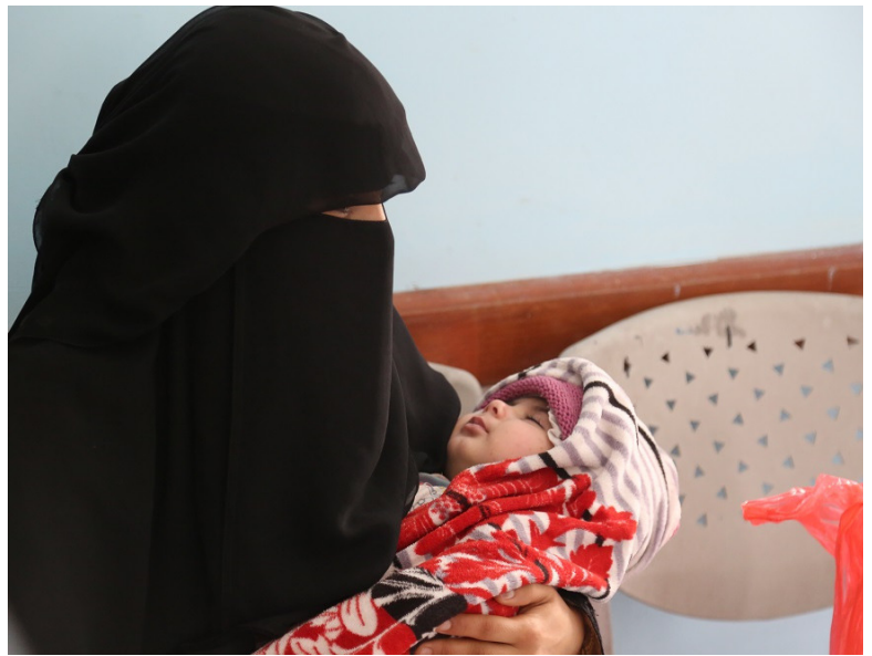
A displaced mother and her newborn in Ibb Governorate