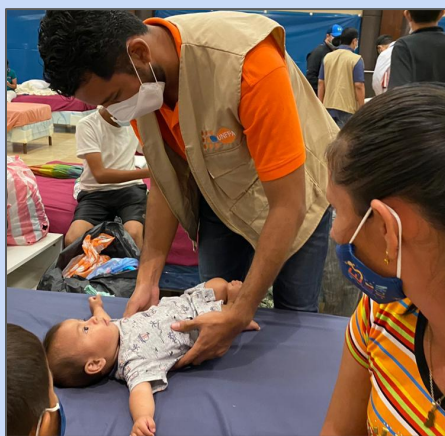
Nearly 12,000 people are staying in shelters following the deadly storm.

Regional level coordination supports country offices to respond to COVID-19 in line with the Global Humanitarian Response Plan (GHRP) and UNFPA's Global Response Plan. The GHRP covers multiple LAC countries with humanitarian needs. These are Colombia, Haiti and Venezuela, which have national humanitarian response plans and an additional 17 countries which are covered by the Refugee and Migrant Response Plan (RMRP) for a coordinated response to the needs of refugees and migrants from Venezuela. The RMRP has been revised to address the needs of refugees, migrants and host communities in the context of COVID-19, particularly as related to health and protection. UNFPA participates in the Regional Interagency Coordination Platform for Refugees and Migrants from Venezuela (R4V) and co-leads the GBV sub-sector. UNFPA also actively participates in the Regional Group on Risks, Emergencies and Disasters for Latin America and the Caribbean (REDLAC) including the health, protection, logistics and shelter sectors.