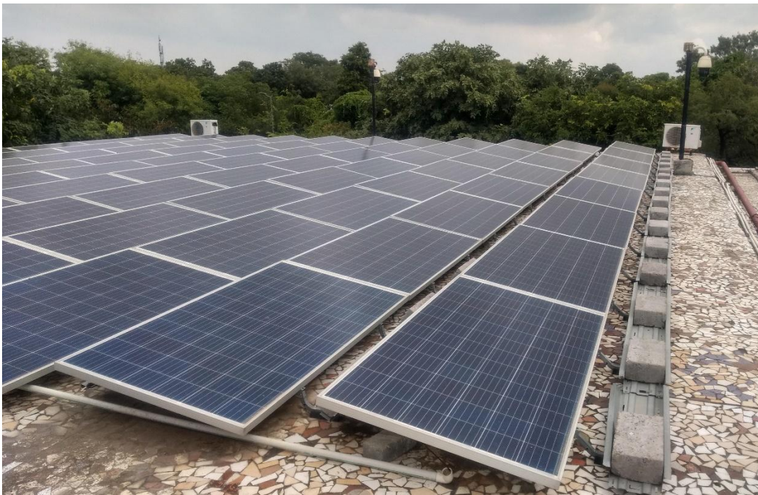
India CO, New Delhi