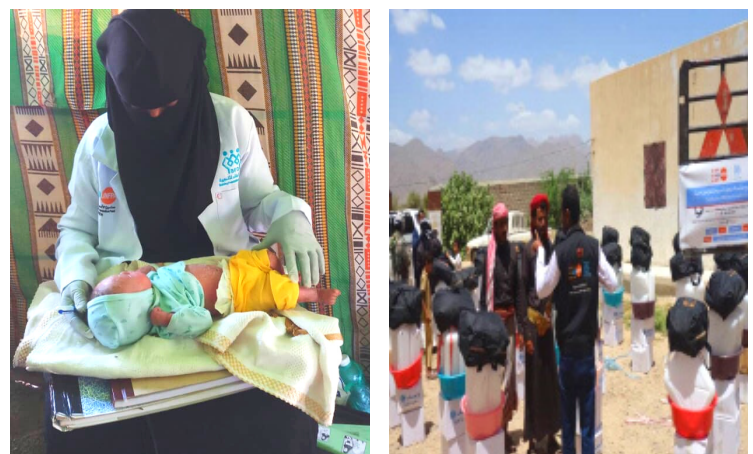
RRM distribution and mobile reproductive health teams at displaced camps in Marib