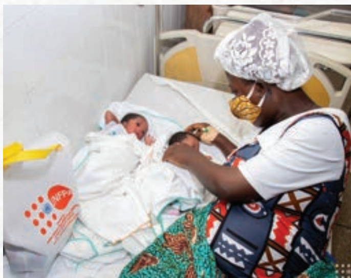
Government donated PPEs and dignity kits to Mercy Hospital Mankessim in the Central Region of Ghana have benefited mothers and babies as well as health workers.

Even though there were challenges, the door-to-door outreach was successful. The initiative surpassed its original goal, with the team distributing over 29,800 condoms and reaching more than 7,000 individuals, including adolescents and teen mothers, with information on sexual and reproductive health (SRH) and gender-based violence (GBV).