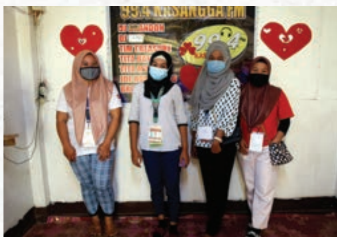
These are some of the volunteer workers helping during the COVID-19 response.

In trying to help the most vulnerable young people in the community, “we provided education and information, but we also looked for ways to ensure that young people are protected,” Genesis said. But, given the context and the resistance to openly discussing contraception, Genesis added, “we talk to them about what family planning services are available or how young people can be protected from HIV and sexually transmitted diseases.”