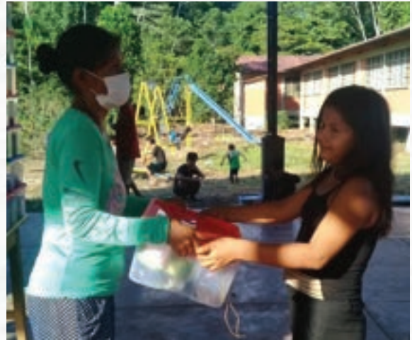
Young mother receives dignity kit from community volunteer.

UNFPA added items to dignity kits to help decrease the spread of COVID-19, with many kits containing masks, hand sanitizer, and COVID-19 prevention information. Equally important, information related to the prevention of gender-based violence (GBV) was added, since movement restrictions, curfews, and closures of public spaces, along with economic struggles from loss of income during this COVID-19 pandemic, had led to a rise in GBV.