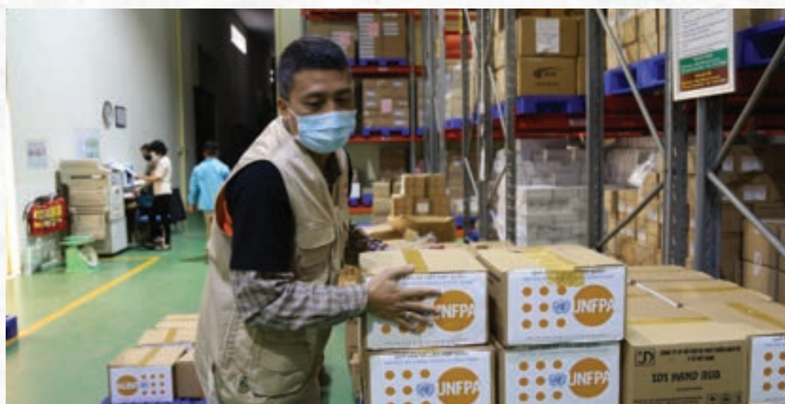
UNFPA Vietnam supports the country's national COVID-19 pandemic response by providing reproductive health supplies.

The featured innovative solutions were selected by regional knowledge management focal points from their respective regional and country offices, with the support of a consultant.