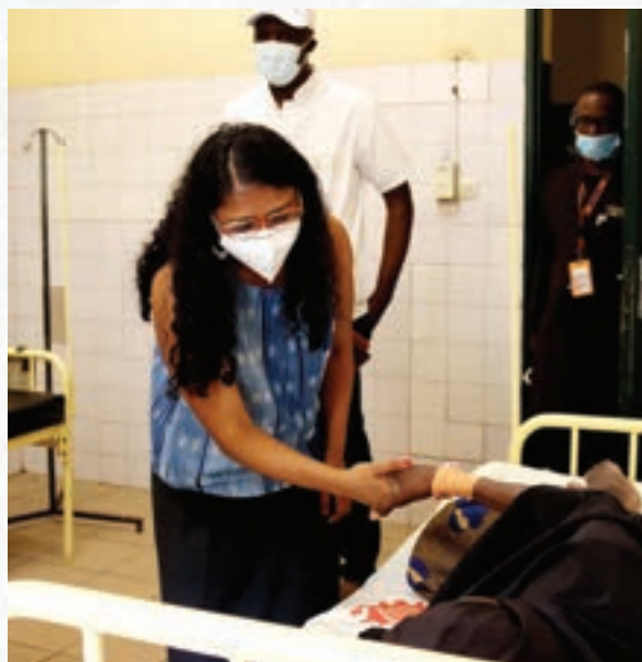
Doctor and health personnel following up on a mother's condition upon admission to the health facility during the COVID-19 pandemic.

Early in the pandemic, UNFPA Mali decided to conduct a study to explore the impact of COVID-19 on gender-based violence (GBV) in the country. Partly this was due to lessons learned in other global health crises, such as the Ebola epidemic, where there was a rise in GBV. For Mali, as in many countries, this meant more women and girls would seek services in an already challenging context with substantially less support available. Data collection was critical in assessing the situation so appropriate strategies could be implemented.