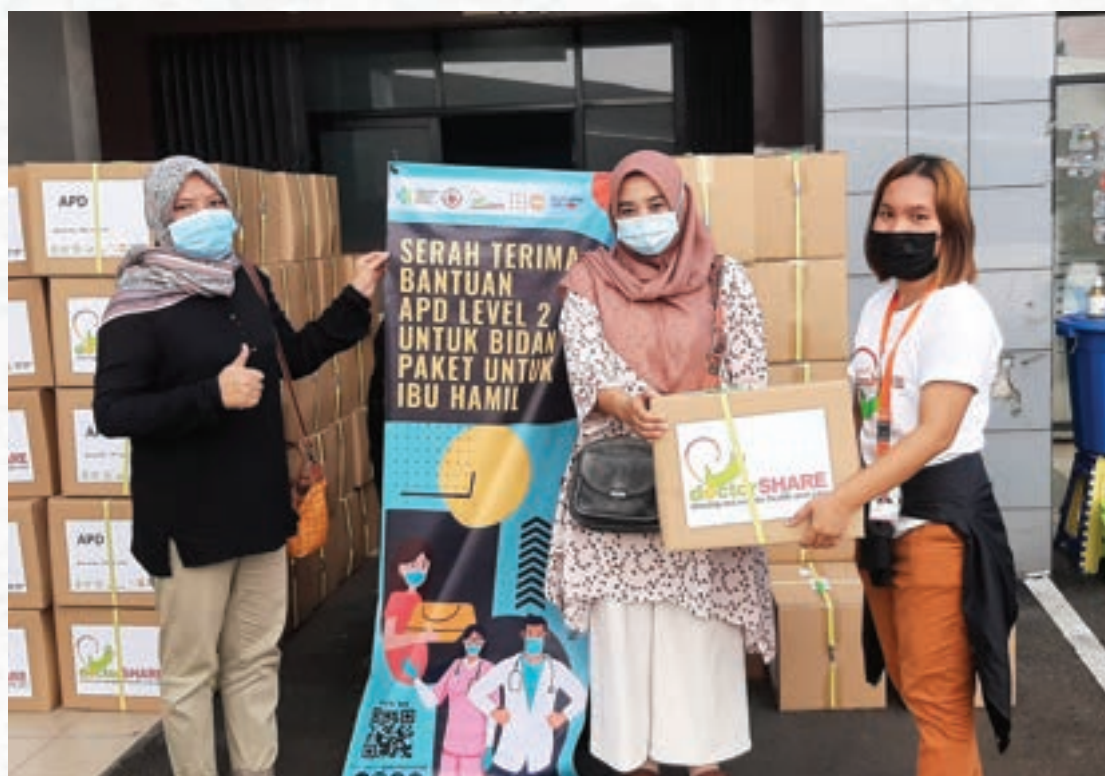
Volunteers receiving PPE supplies for their community work.

Regular COVID-19 testing for the team and using different vehicles for PPE deliveries became the standard procedures to minimize the risk of transmission during long-distance convoys. “We took the antigen test before we went to East Java, and we used our personal cars to travel to make sure that we do not expose others to the virus,” Andrew emphatically added.