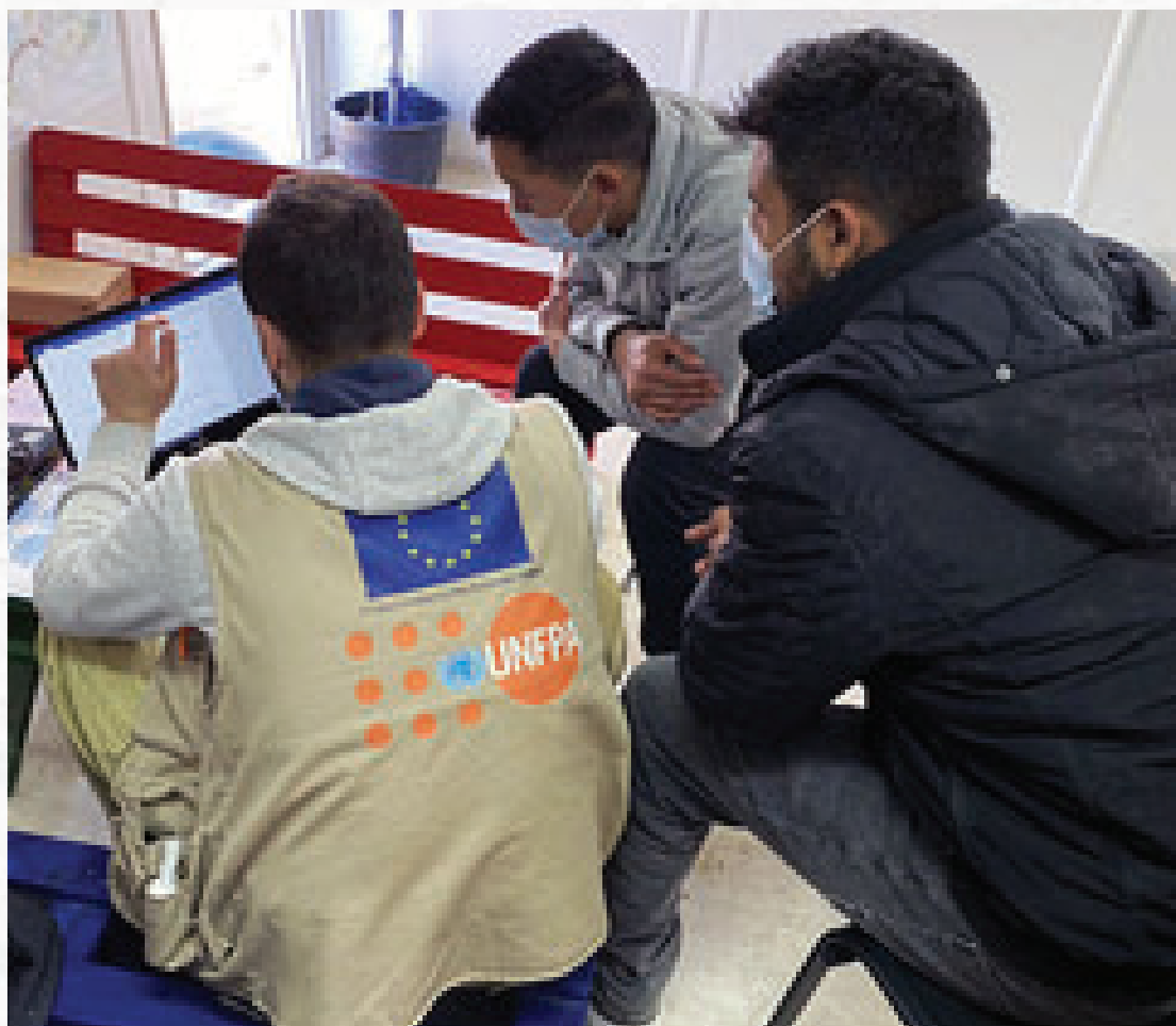
Ensuring access to HIV medications even during the COVID-19 pandemic