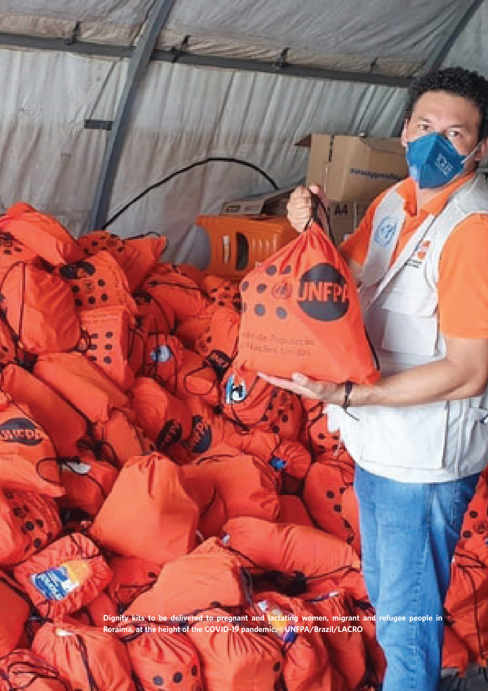
Dignity kits to be delivered to pregnant and lactating women, migrant and refugee people in Roraima, at the height of the COVID-19 pandemic.