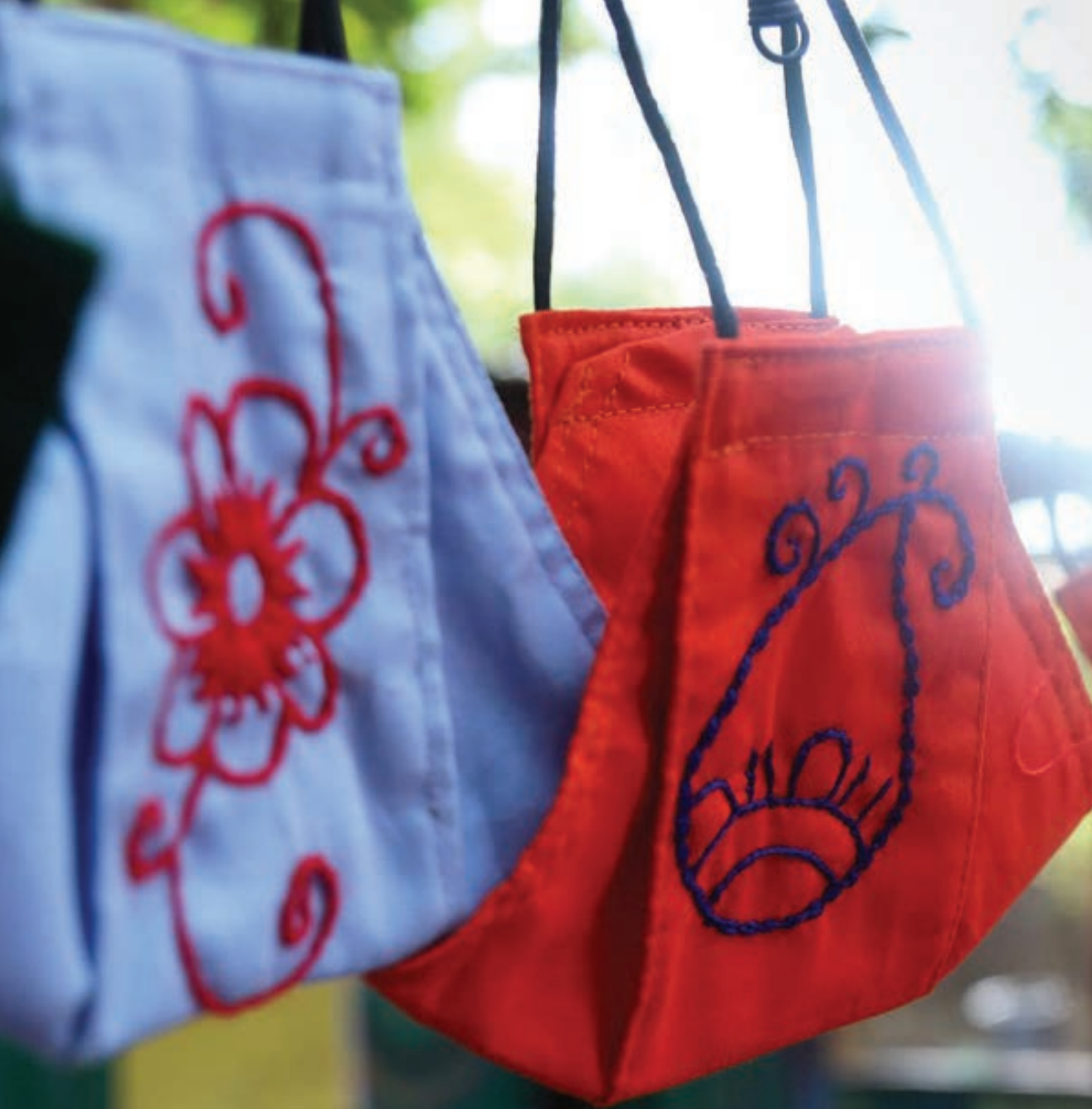
Colorful reusable masks hand-made by a Rohingya women's group in the refugee camp of Coxs bazar.