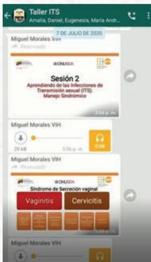
A screenshot of the WhatsApp platform.

WhatsApp was the central platform within an integrated structure, including other virtual media such as Google mail, Google format, Google Drive, Google site, virtual whiteboards, and a web page associated with each course. This way, participants could engage in interactive learning and access a set of resources and supporting materials.