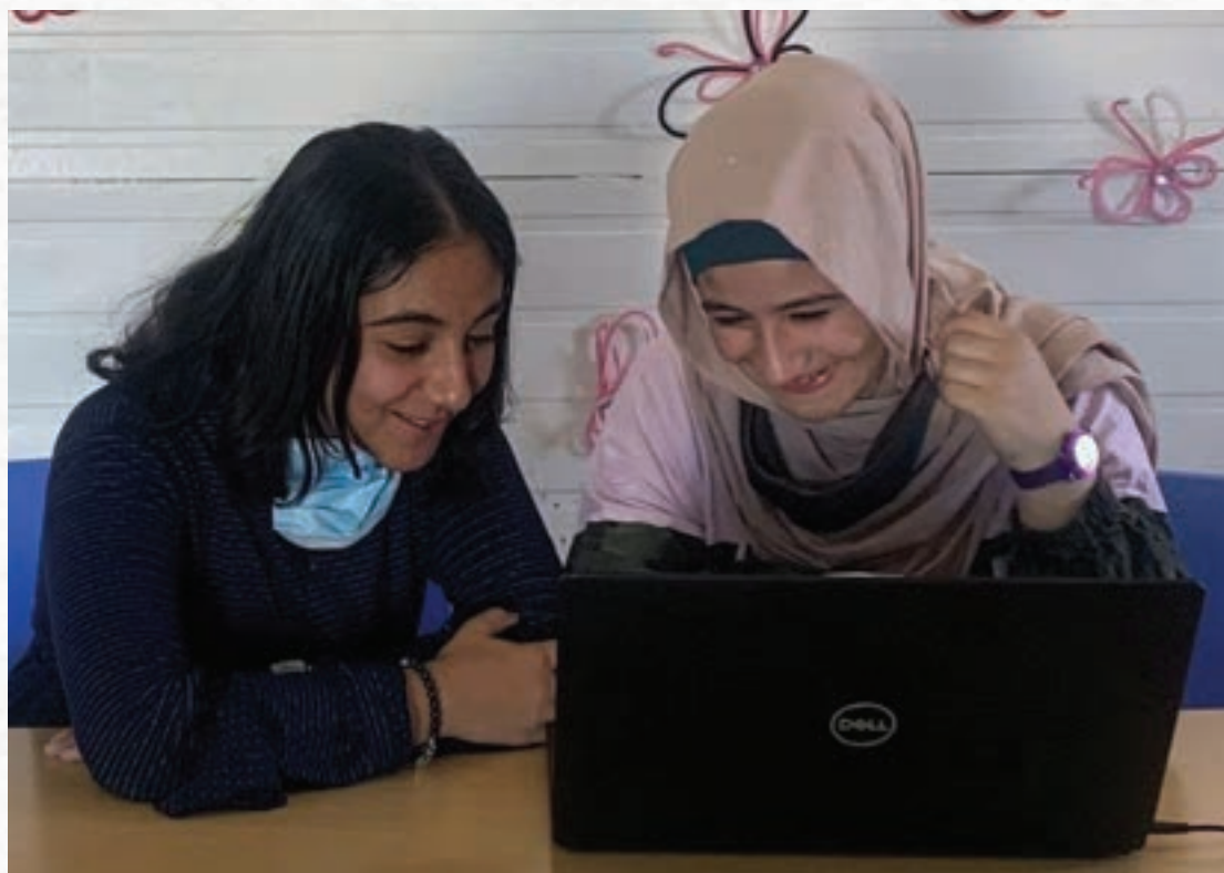
The use of e-learning apps untaps potential for girls' empowerment even during the COVID-19 pandemic.

The Amaali app had other features, such as identifying unsafe areas in the community. Users could share these ‘risk points’ by selecting them on a map or by sharing their location, which could also be classified by the type of danger posed to women and girls.