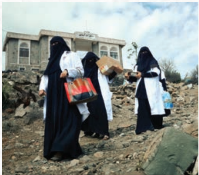
In addition to the availability of telecounseling, healthworkers undertook follow-up community visits to GBV survivors.

life became better after I made my first call seeking help. It felt as if my husband had destroyed my soul with all the violence. He threw me out of the house with two children. I couldn't imagine that humanity still existed in the world. But the counselor helped me to speak after years of silence. She taught me how to begin a new life full of hope. I learned to trust myself and to depend on myself. They even referred me to vocational training where I learned a livelihood."