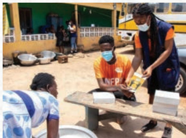
Community volunteers explain SRH and COVID-19 related information to a woman from the community.

Acting on these important lessons learned from past disease outbreaks and humanitarian crises, UNFPA Ghana created a door-to-door outreach programme for volunteers and staff to safely distribute packages containing items related to sexual and reproductive health (SRH), gender-based violence (GBV), and COVID-19, to under-resourced communities.