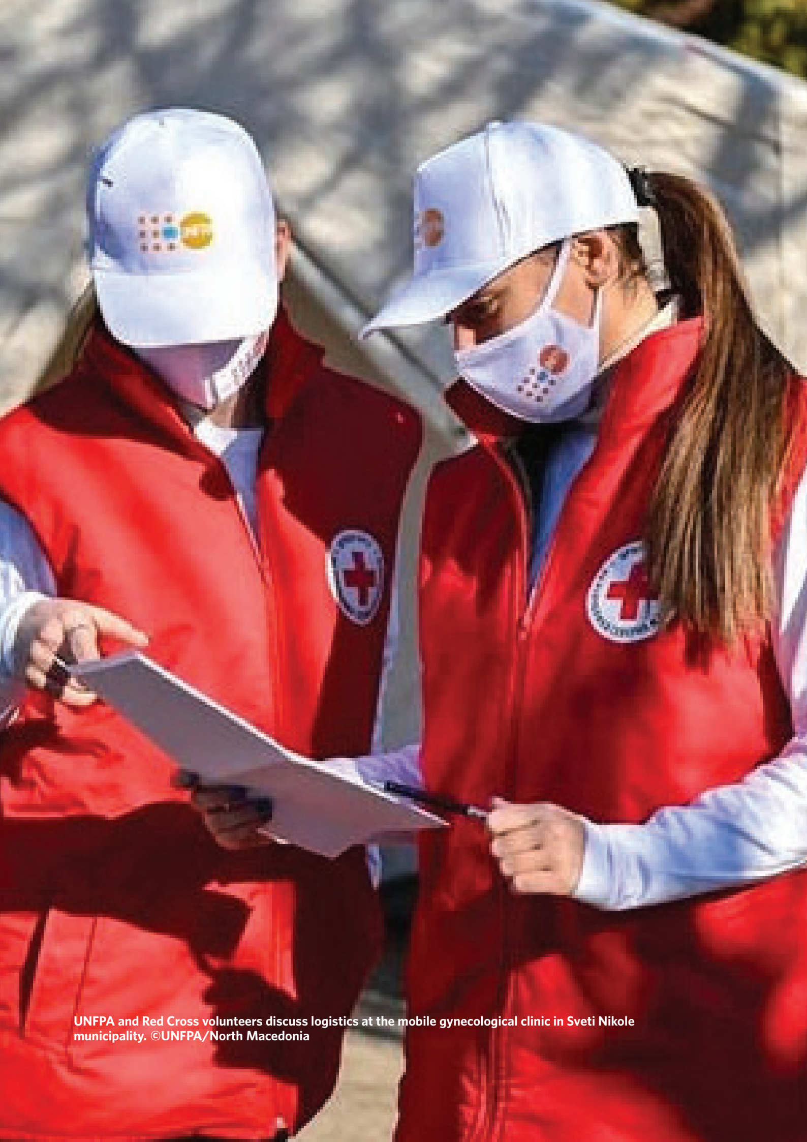
UNFPA and Red Cross volunteers discuss logistics at the mobile gynecological clinic in Sveti Nikole municipality.