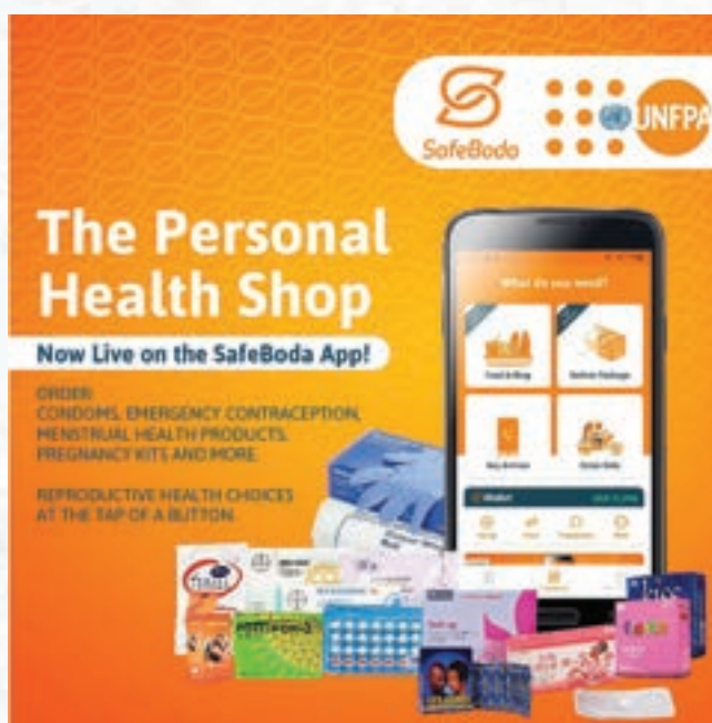
RH supplies available through the SafeBoda app.

Uganda wanted to use contraception but did not. With the app, women could order items privately and receive home deliveries. The initiative increased women's and adolescents' access to all reproductive health supplies.