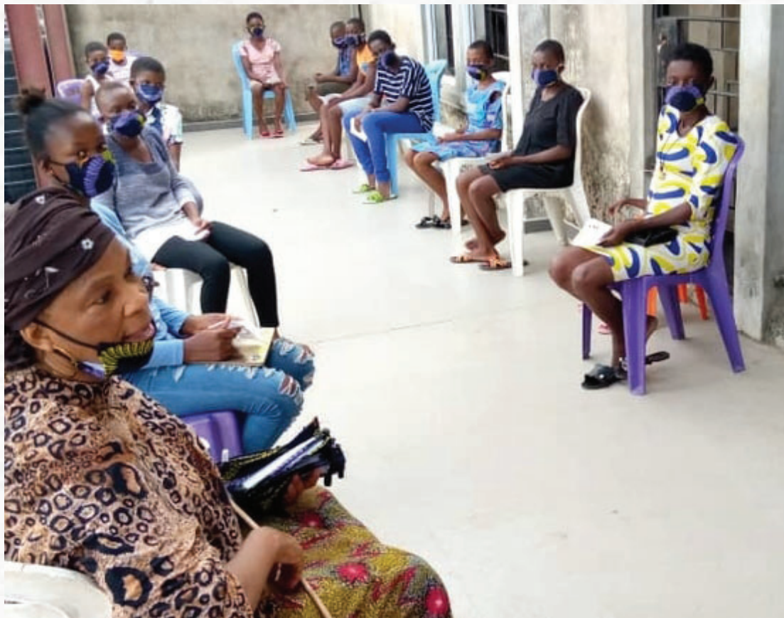
Supporting efforts to address COVID-19 and its impact on the most vulnerable.