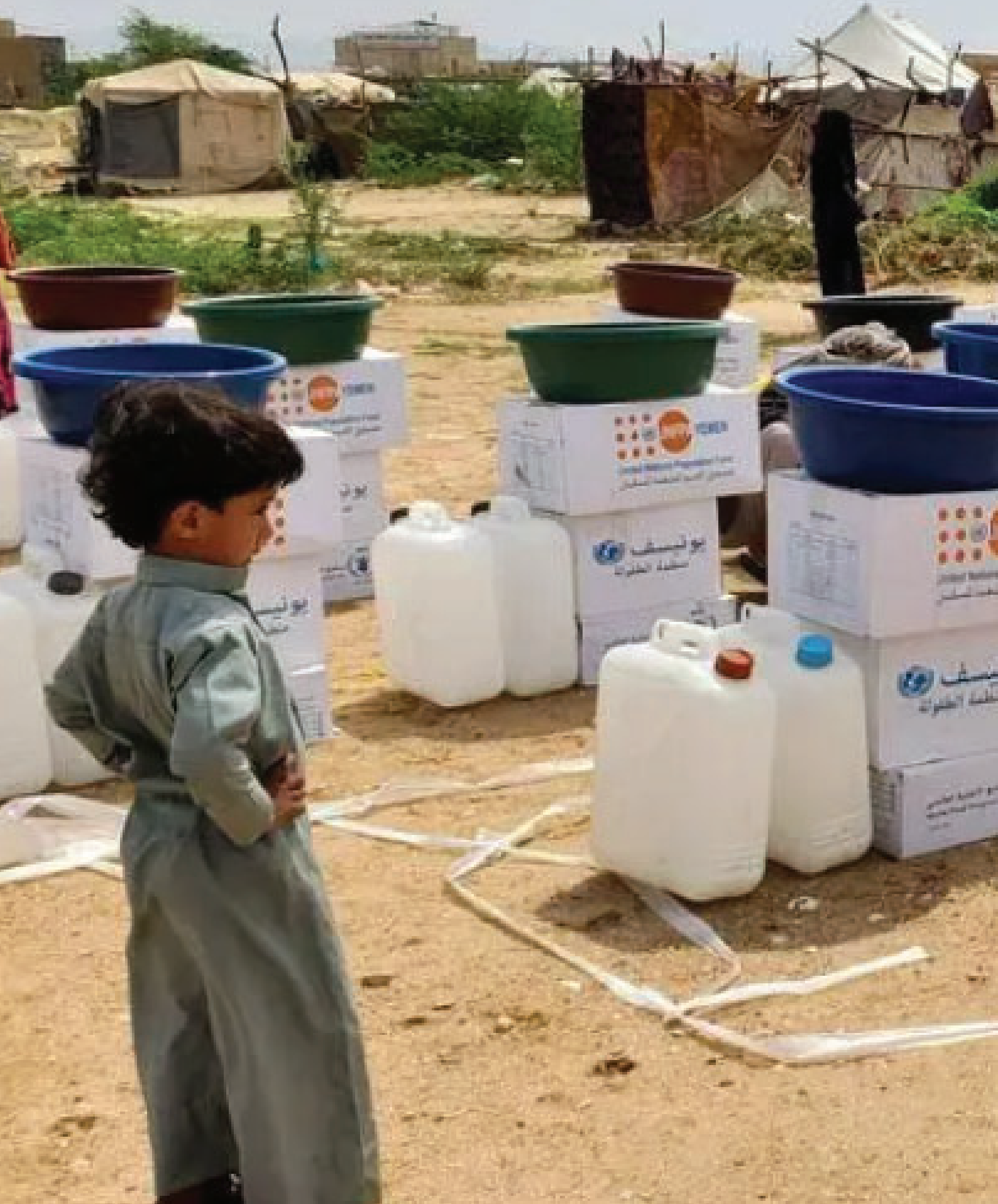
Distribution of kits containing basic health and hygiene items, clothes and ready-to-eat meals for the emergency relief effort in Al Jawf, Yemen.