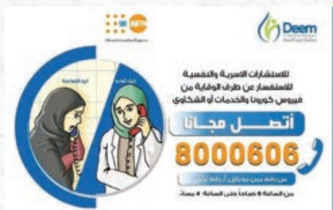
A poster of the hotline service disseminated at the community level through UNFPA partners.

Even before COVID-19, the United Nations (UN) declared Yemen the worst humanitarian crisis in the world. After years of war, it was estimated that 24 million people in the country needed aid and protection -