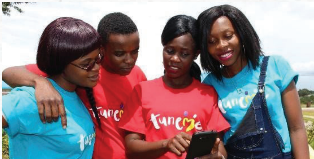
Young people checking out the TuneMe app.