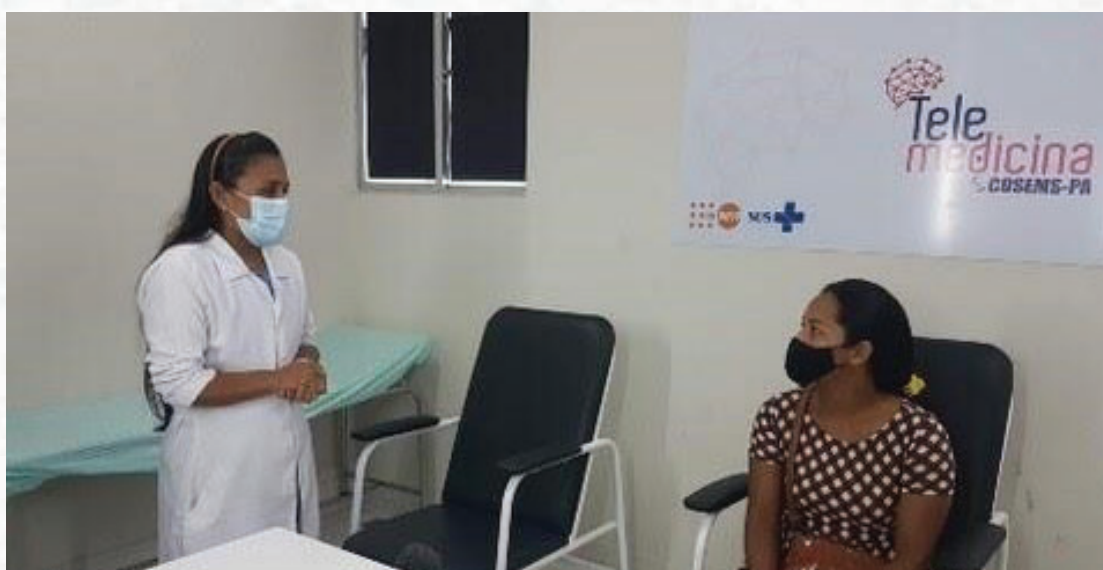
A counselling session in a migrant-focused clinic in Icacos village, provided through a partnership between UNFPA and the Family Planning Association of Trinidad and Tobago.

In Icacos, a place at the remote southern point of Trinidad, access to basic healthcare was limited for locals. Displaced Venezuelans were afraid to seek services because of their migratory status. Even when individuals managed to travel for a medical appointment, they were often unable to attend necessary follow-up appointments, which could lead to poor health outcomes. To address that, an outreach clinic was set up to use telemedicine for follow-up services.