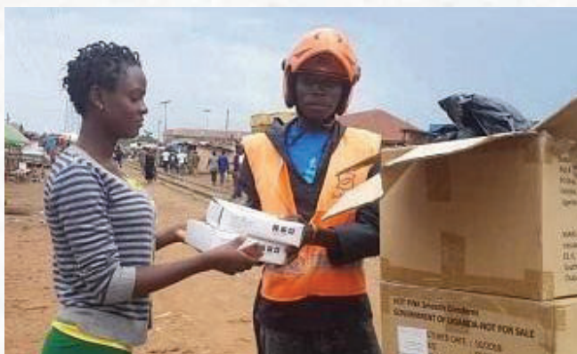
Customer receives delivery of RH supplies from SafeBoda driver.

condoms from the government. When the order was placed, the app identified the closest pharmacy within a seven-kilometer radius with the item in stock and alerted the nearest SafeBoda driver. The driver then picked up the item and delivered it to the user.