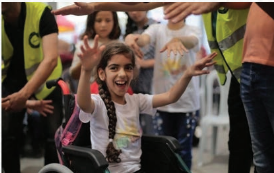
Ensuring that the needs of persons with disabilities are recognized and addressed.

The report aimed to inform policy- and decision-makers about the needs and rights of persons with disabilities threatened by the effects of COVID-19. It pointed out that an estimated 15.1 per cent of people worldwide experienced some form of disability. In the East Mediterranean region alone, the World Health Organization estimated that more than 100 million individuals have some disability.