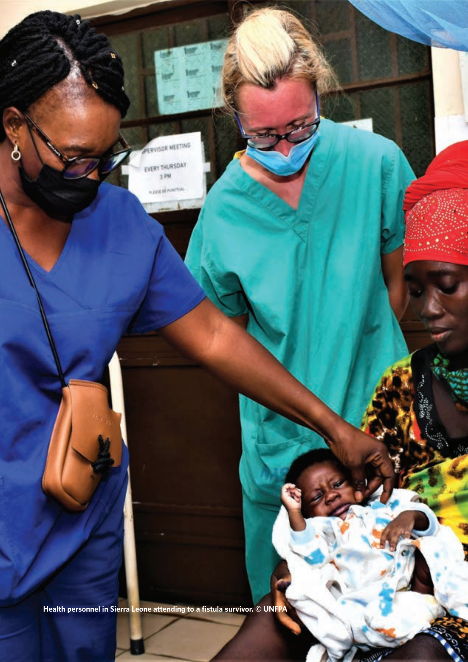
Health personnel in Sierra Leone attending to a fistula survivor.