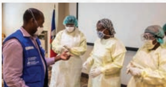
Helping fight COVID-19 through continued provision of sexual and reproductive health services.

Throughout the pandemic, regional and country offices endeavored to design and implement creative programme solutions, including using information and communications technologies, and partnering with community-based networks and volunteers to continue delivering the organization's mandate.