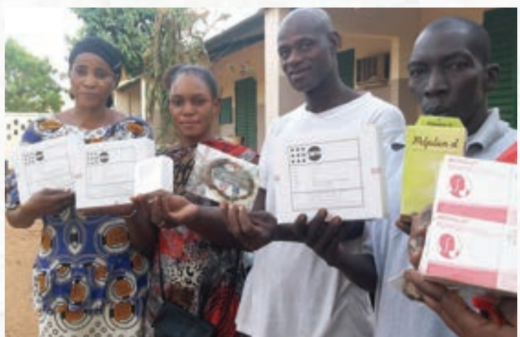
Family planning services continue even during the period of COVID-19.

In mid-March 2020, the government of Mali instituted a protection plan to prevent the spread of COVID-19. This included measures such as instituting a curfew, suspending large public gatherings, closing schools and bars, and decreasing hours for public administration and markets.