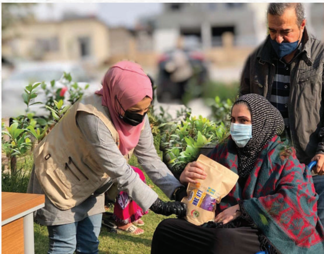
Making sure that people with disabilities have access to high quality services.

The report pointed out that the pandemic provided an opportunity to address accessibility problems for persons with disabilities. It concluded with a comprehensive set of recommendations for donors, international organizations, civil society organizations, policymakers, service providers, academics, and governments. Only through a “ whole society approach ” could the world see a truly inclusive society where the needs and rights of all individuals are recognized and realized.