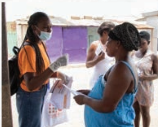
A community volunteer hands out information materials on sexual reproductive health and COVID-19 to a pregnant women, seeking help during the pandemic.

But, many found this refreshing. For example, one volunteer said, "most of the young people we reached out to readily accepted the condoms and asked questions on how to access more should their friends request some." They further noted that the men in the community seemed more open to the subject of sexual and reproductive health than the women. Some even candidly shared their reasons for wanting condoms before the volunteers mentioned anything. "I found it enlightening," said one volunteer.