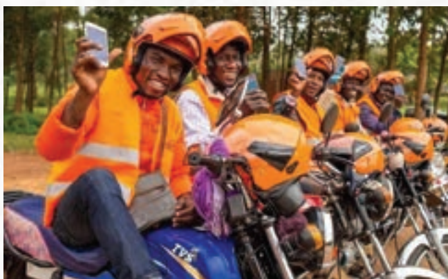
Drivers of Safe Boda - a bike hailing app used to distribute contraceptives in Uganda.

Many reproductive health supplies were subsidized and affordable, and users could order free