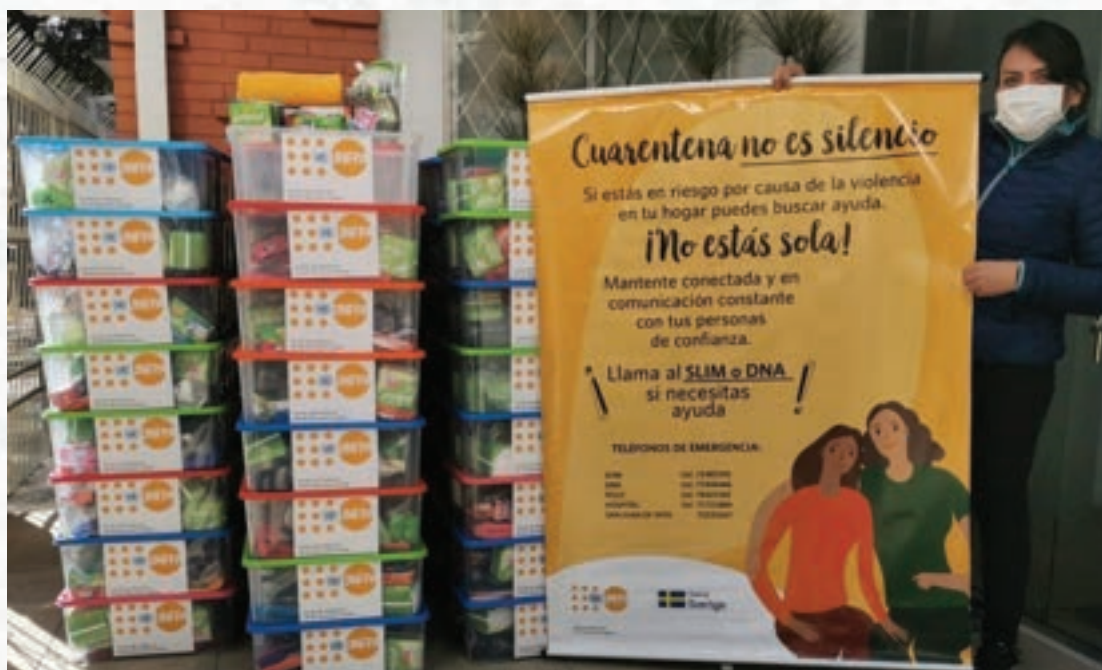
Providing dignity kits and COVID-19 information help save lives during a pandemic.

In response, UNFPA in the Latin America and Caribbean Region distributed dignity kits to women and girls to help ensure their health, rights, and dignity. Dignity kits differ depending on the context but often include sanitary pads, hand soap, underwear, toothpaste, and laundry soap. They are made to be culturally relevant and specific to the situation, so some may contain a headscarf or reusable sanitary pads, while others may contain a chamber pot or privacy shield for women who cannot access bathrooms easily or safely.